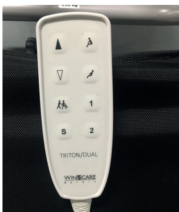
New hand control with more functions, for example two programmable memory buttons and one for safe transportation