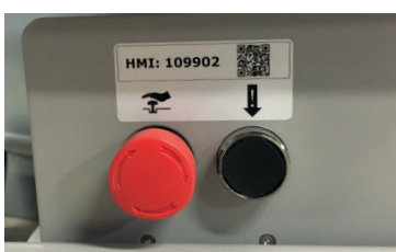
Emergency stop and lowering