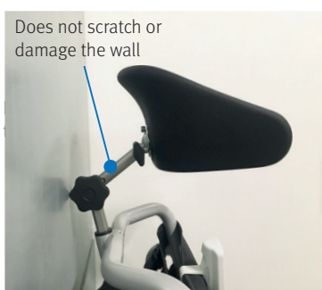
Multi adjustable head rest