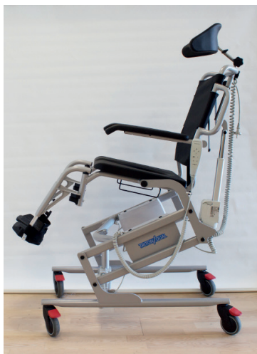
Triton/Dual with electric lifting function and tilt (backwards -30 / forward +7 degrees)