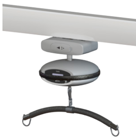
Luna Mover mounted on the Mobile Flex