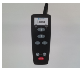
The familiar hand control with arrows indicating transfer direction