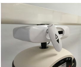
The integrated safety release handle allows manual transfer if needed