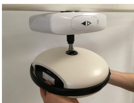
Easy mounting of the Luna